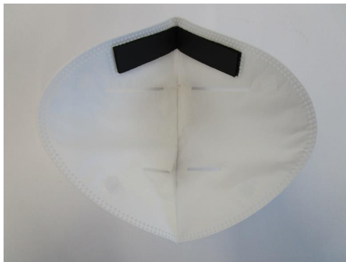
Inside view ***End of Report***